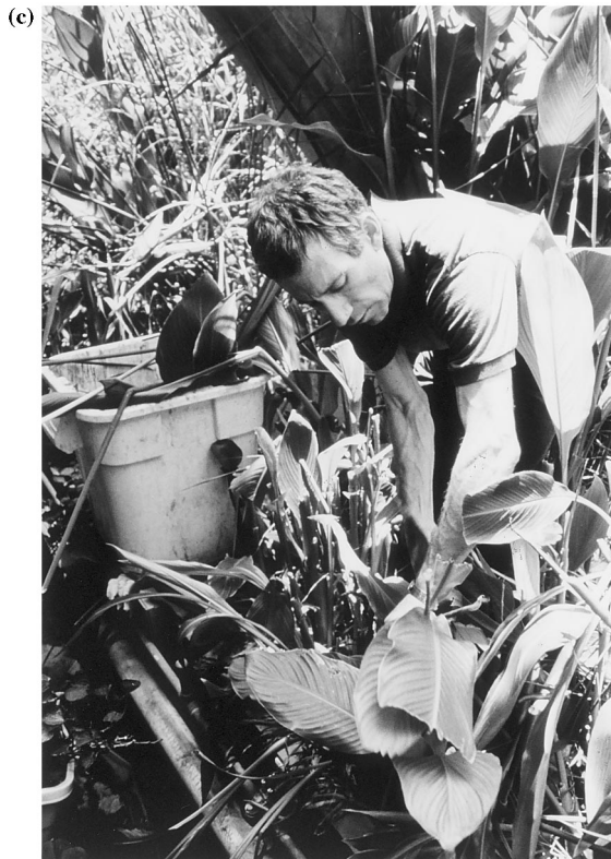
Fig. 2. (Continued)

on a clear sunny day (15 January 1994) outside solar insolation was measured with portable light meters as 1050 microEinsteins \text{m}^{-2} \text{s}^{-1} and above the plant canopy of a wetland near the glass it was 820 microEinsteins \text{m}^{-2} \text{s}^{-1} , and above a wetland canopy with supplemental artificial lights light was 930 microEinsteins \text{m}^{-2} \text{s}^{-1} . For these systems, incident light at the water level below the plant canopy was 25 and 40 microEinsteins \text{m}^{-2} \text{s}^{-1} , respectively. Overall, plant productivity was much higher in seasons of greater insolation during the 2 year closure. For example, harvest records show that during 3 months of low light (November, 1992–January, 1993) fodder harvests from the wetland totaled 152 kg versus 242 kg harvested May–July 1993. During December 1991 and December 1992, light levels in the agricultural area measured by automatic electronic sensors averaged 9–10 Einsteins \text{m}^{-2} \text{day}^{-1} while in June 1992 and June 1993, incident light averaged 24–25 Einsteins \text{m}^{-2} \text{day}^{-1} .