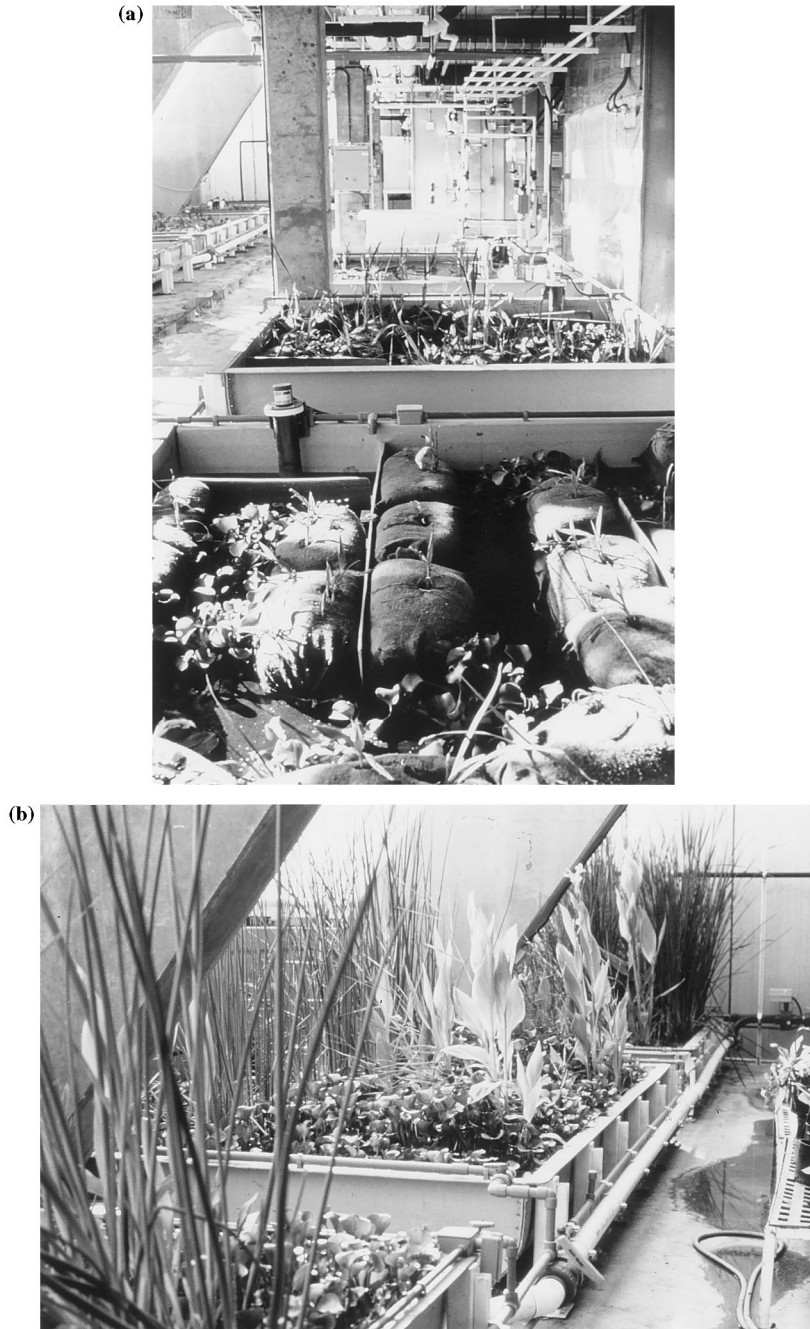
Fig. 2. The wetland plant lagoons (a) shortly after planting (spring 1991). Burlap was used to hold emergent plants and soil; (b) shortly after commencement of the closure experiment, September 1991; (c) Mark Nelson harvesting fodder from the human habitat wetland wastewater tanks. This fodder was fed to domestic animals and inedible plant material was composted.